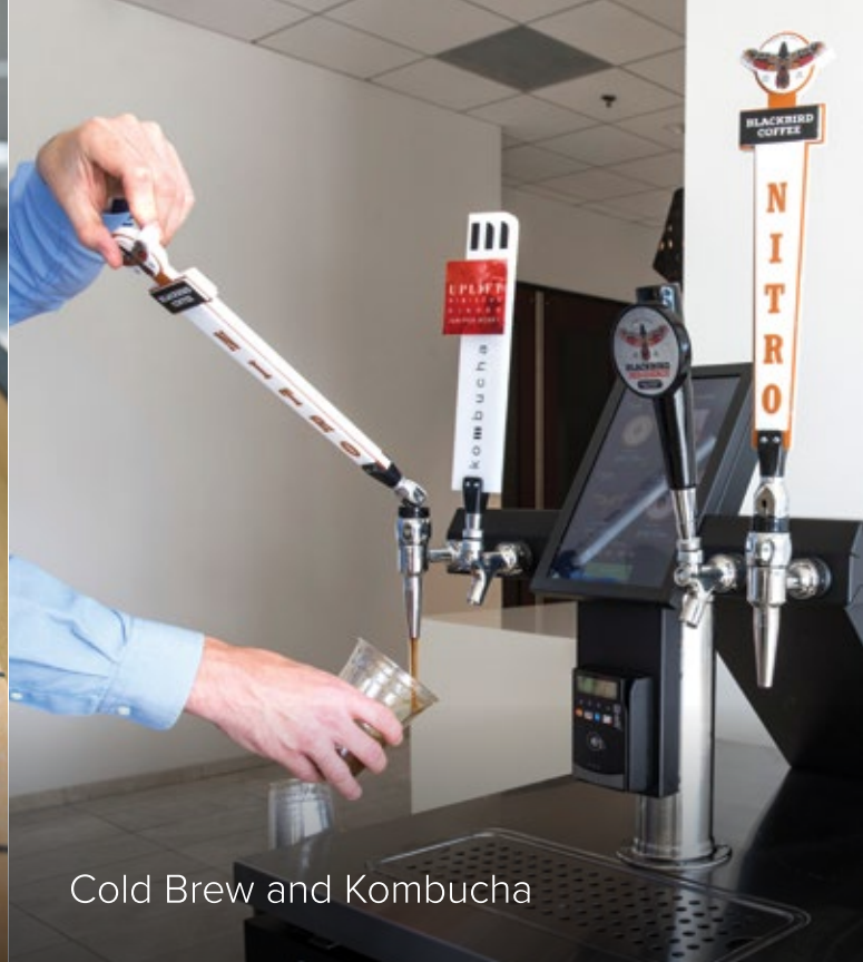
Cold Brew and Kombucha