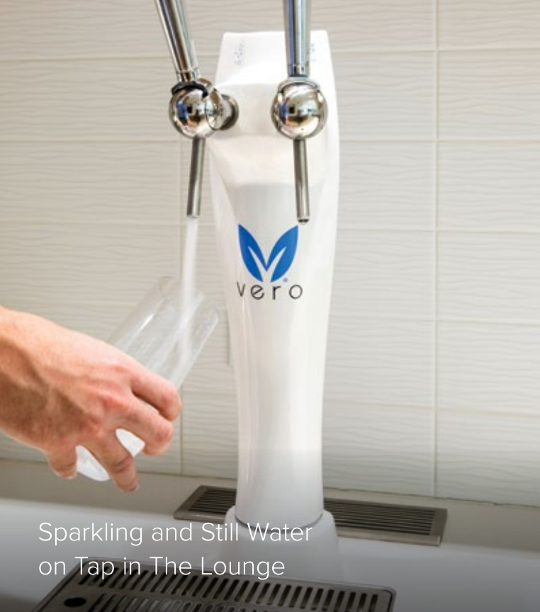
Sparkling and Still Water on Tap in The Lounge