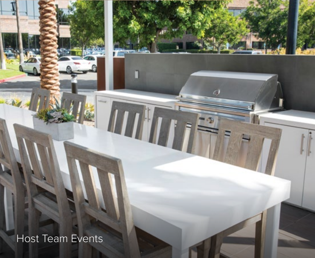
Host Team Events