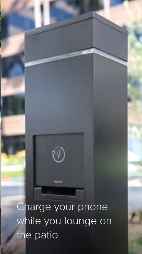
Charge your phone while you lounge on the patio